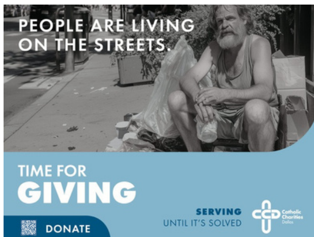
Example of yard sign

To view the multiple ways to give, scan the QR code or visit ccdallas.org/tfg On behalf of all those we serve, thank you!